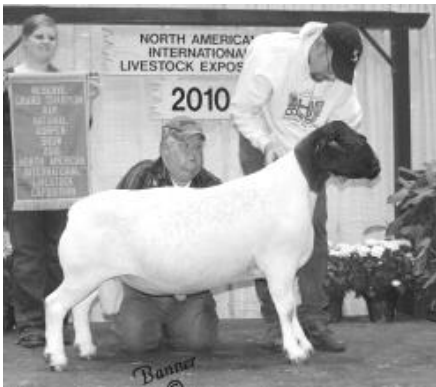
RF 5208 "Incredible"

A result of our AI program. Maternal brother to Lot 2. This guy is massive in his muscle shape. He has been a standout since birth. We are keeping his twin sister. 5150 offspring just keep getting better with age.