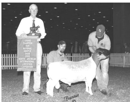
RF 5036 "Impressive"

5818 was Champion Ram at the 2013 Kentucky State Fair. His twin was Champion Ram at Duncan in 2013. Sired by "Incredible", 4930 sired the Champion Ewe at Sedalia last year ($20,500). 4415 is our best Dorper female and past National Champion. 1870 has been a super producer for us. All our late lambs are sired by this guy. These are impressive!